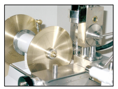
Execution of gear cutting by Divided plate

Chucks shank Ø 8mm Height of centers 62 mm Distance between centers 170 mm Bed lenght 300 mm Overall dimensions: 240x420x160h mm Electric Motor 220 V – 10 Hp range of speed from 50 to 3000 rpm Approx. Net Weight kg 13